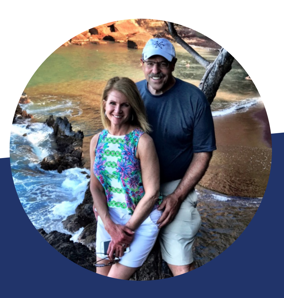
Photo submitted by Gregg from Connecticut , valued annuity customer since 2015 .